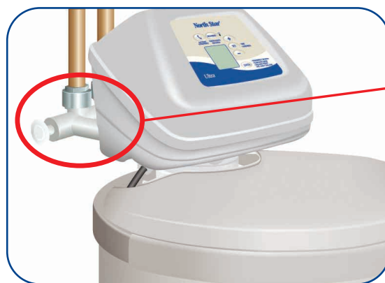
North Star Bypass Valve with Lock-out Order P/N 7256165 – 3/4" Service Order P/N 7264859 – 1" Service